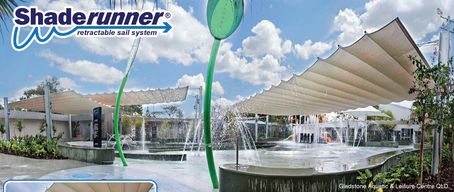
Gladstone Aquatic & Leisure Centre QLD