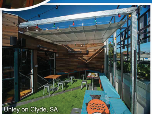
Unley on Clyde, SA