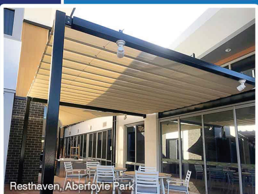
Resthaven, Aberfoyle Park