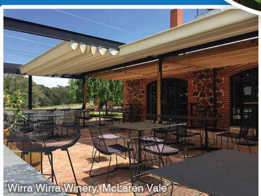
Wirra Wirra Winery, McLaren Vale