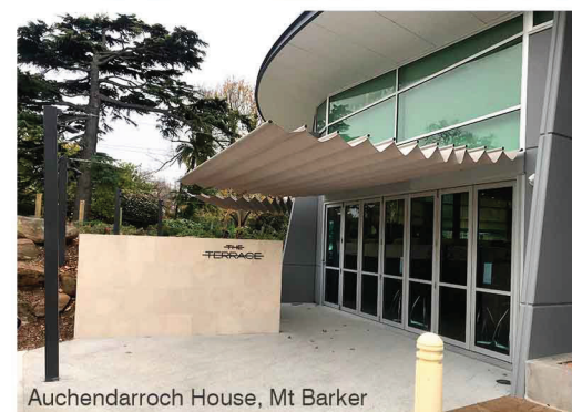
Auchendarroch House, Mt Barker