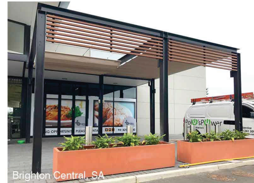
Brighton Central, SA

Versatile by design, the Shaderunner® is ideally suited to a range of structural support systems. The Shaderunner® is typically fixed to buildings, fascias, walls, posts, pergolas, custom structures or a combination of these - plus more.