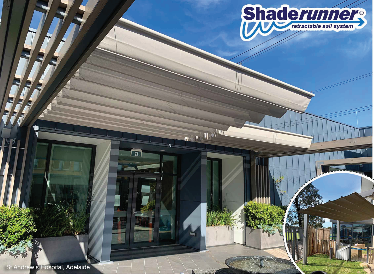
St Andrew's Hospital, Adelaide