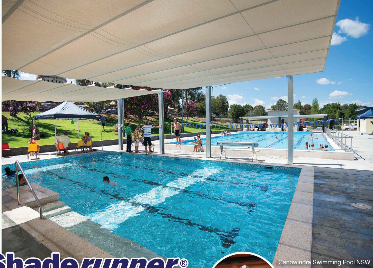
Canowindra Swimming Pool NSW