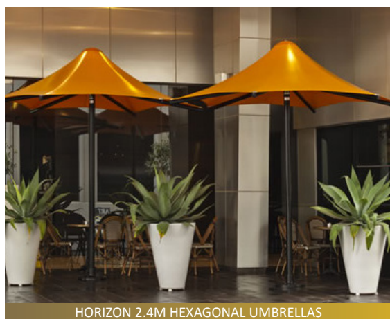
HORIZON 2.4M HEXAGONAL UMBRELLAS