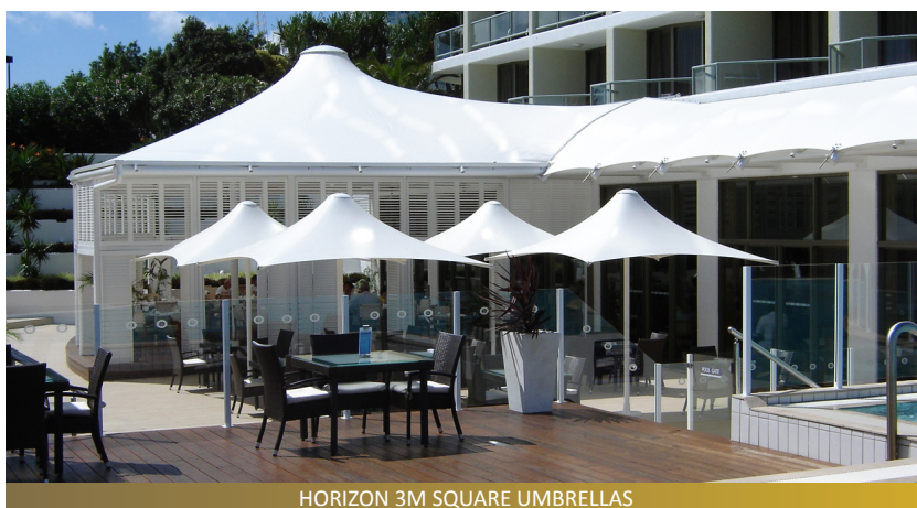
HORIZON 3M SQUARE UMBRELLAS