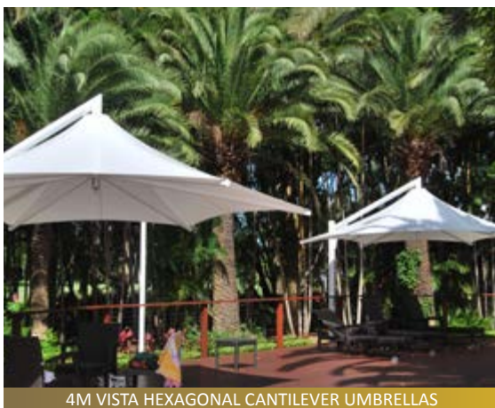
4M VISTA HEXAGONAL CANTILEVER UMBRELLAS